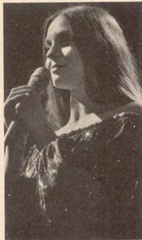
Crystal Gayle "My roots are in country, but I consider myself just a singer."

Thinking back to her own childhood and ambitions to be a singer she adds, "You know, I think all children dream of what they want to be. No, let