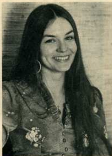
"I'm camera shy," she says.

Ever since she was a kid, Crystal Gayle has been around music. Although she plays piano and guitar, she says she prefers not to accompany herself while she's on stage. She got her first taste of the limelight when she accompanied big sister Loretta on tours during summer vacations from high school. She liked the feeling, and deter-