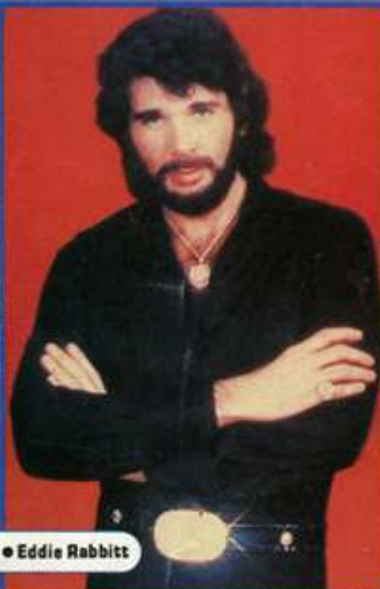
Barbara Mandrell • Eddie Rabbitt