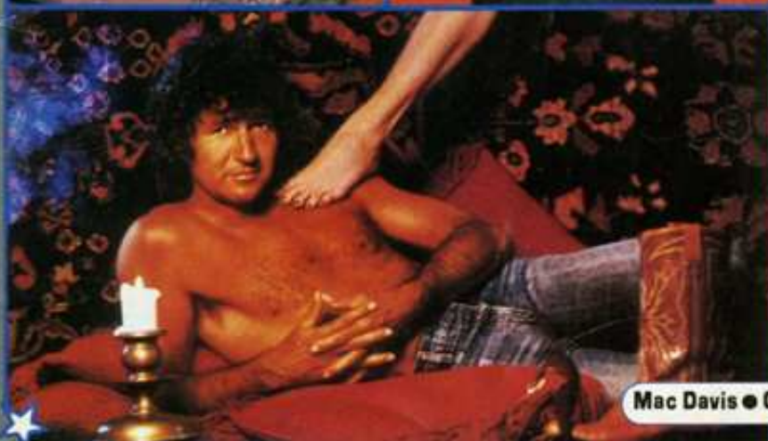
Mac Davis • Crystal Gayle