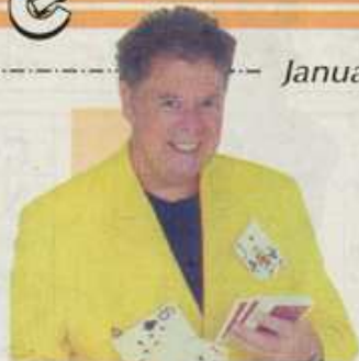
Charlie Prose Riverside Resort page 12